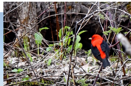
Meyer Nature Preserve