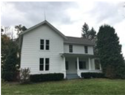
Staebler homestead site of the Michigan Folk School

7734 Plymouth Road, Superior Township, MI 48198 www.MiFolkSchool.com registrar@MiFolkSchool.com (734) 436-8973