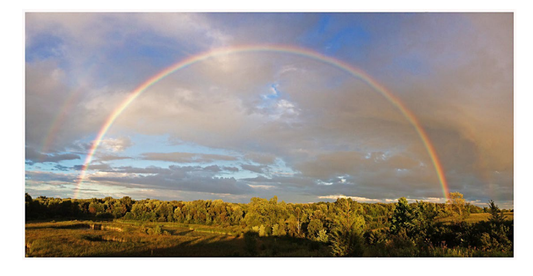
Rainbow over LeFurge Woods Nature Preserve