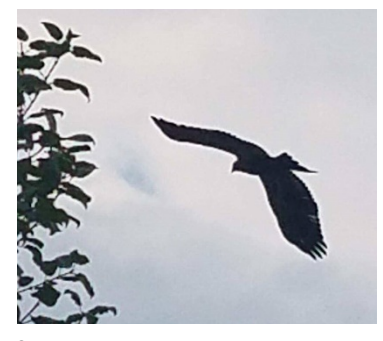
Golden Eagle on Vreeland Road